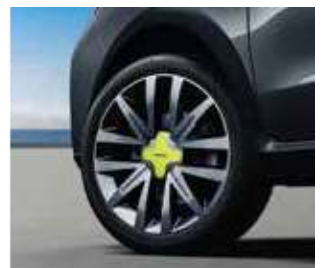
17-inch Aluminum alloy rim