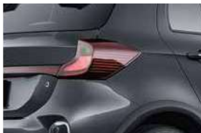
C-shape blacken-through-style taillight