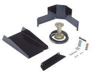
QUICK HITCH WITH DRIVE 196-602-000