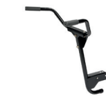
HANDLE FOR HAULER 19A400270EM