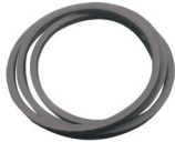
DECK BELT V TYPE: A SEC X 90.95" 754-05159