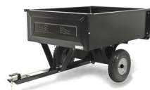
STEEL CART 190-223B000