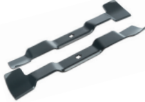
BLADES XT 95 CM 19A1328B603