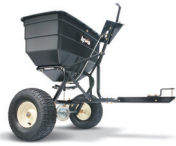
SPREADER LARGE 196-036-000