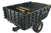
HAULER TRAILER 19B40026100R