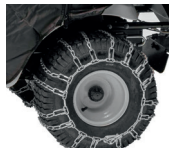
SNOW CHAINS NX15 RD 490-241-0022