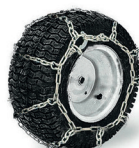
CHAINS 18X9,5 196-898-699