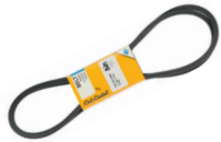
DECK BELT XT 95 CM 19A1316A603