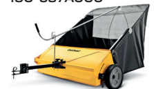
SWEEPER 112 CM CUB CADET 196-543-000