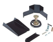
DRIVELINE RD 196-608-000