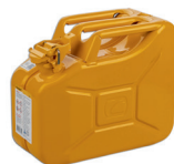
FUEL CAN CC 10L 196-558-603