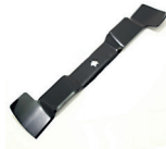
BLADE LEFT 742-05255