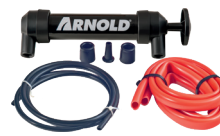
OIL EXTRACTION PUMP 6011-U1-0001