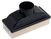
AIR FILTER KM-023440 (11013-0727)