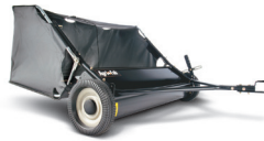
SWEEPER 107 CM 190-163A000