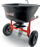
SPREADER MEDIUM 196-545-000