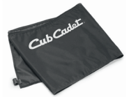
ANTI-DUST SYSTEM NX15 320L CC 196-555-603