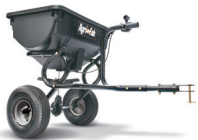
SPREADER SMALL 196-031B000