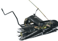
FRONT SWEEPER SINGLE 196-603-000