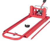
CLIP LIFT 6031-X1-0013