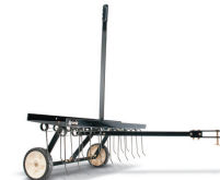
TINE DE-THATCHER 101,6 CM 190-526-000