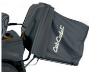
ELECTRIC BAG LIFT 196-570-600