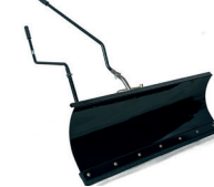
DOZER BLADE 196-606-000