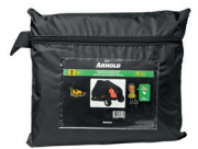
PROTECTION COVER 2024-U1-0004