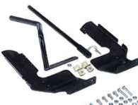
ADD-ON PARTS RD 196-610-000