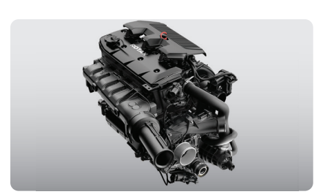
Rotax® 1630 ACE™ - 300 Engine

An innovative, industry-first system that allows you to free your pump of weeds and debris with intuitive handlebar-activated controls.