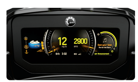
Full-Color 7.8" Wide Display

An innovative hull that sets the benchmark for rough water handling, stability and offshore performance.