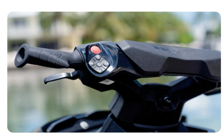
iDF - Intelligent Debris-Free Pump System

The industry's first manufacturer-installed truly waterproof Bluetooth<sup>†</sup> audio system.